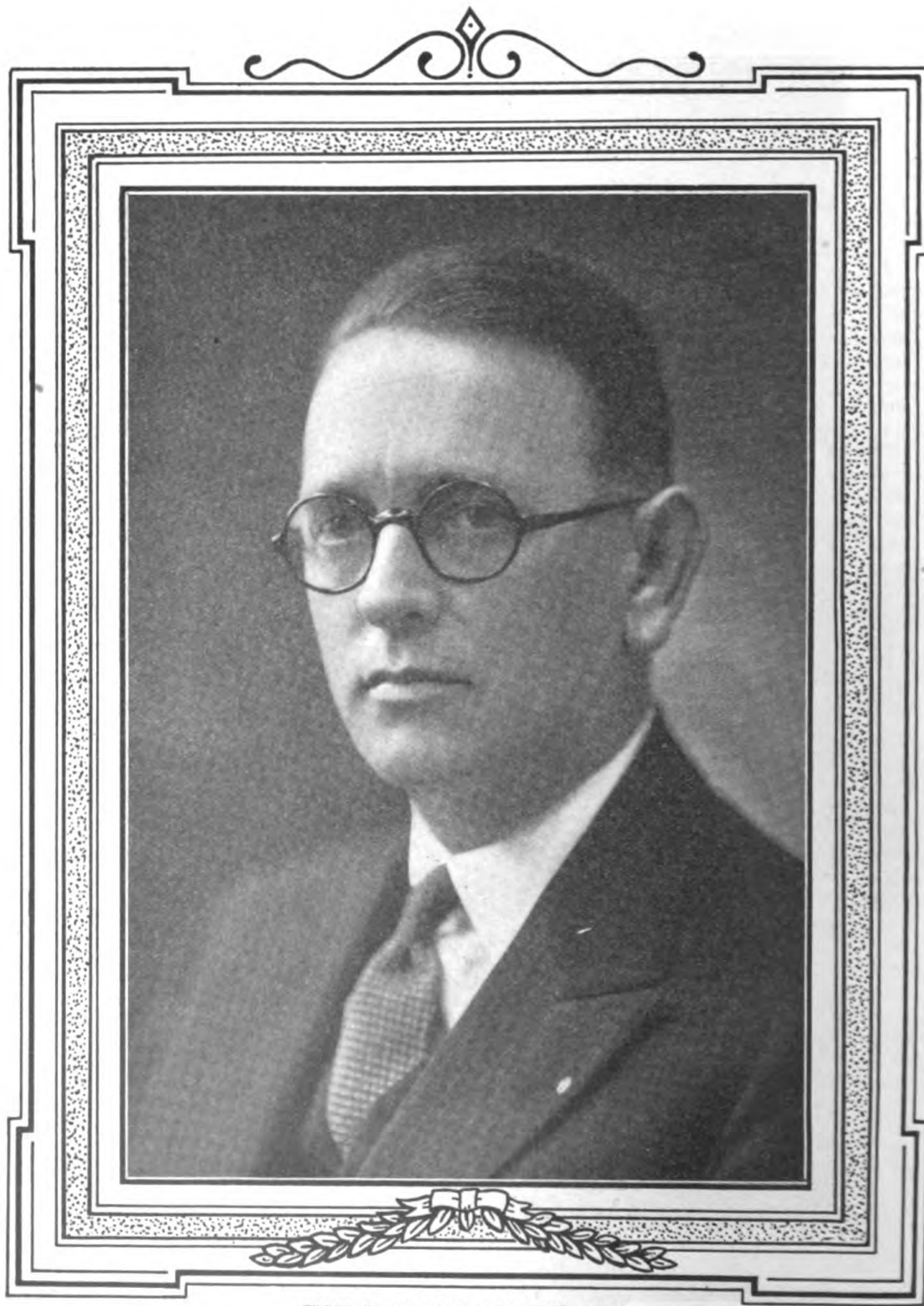
HON. FRANK D. FITZGERALD Governor of Michigan